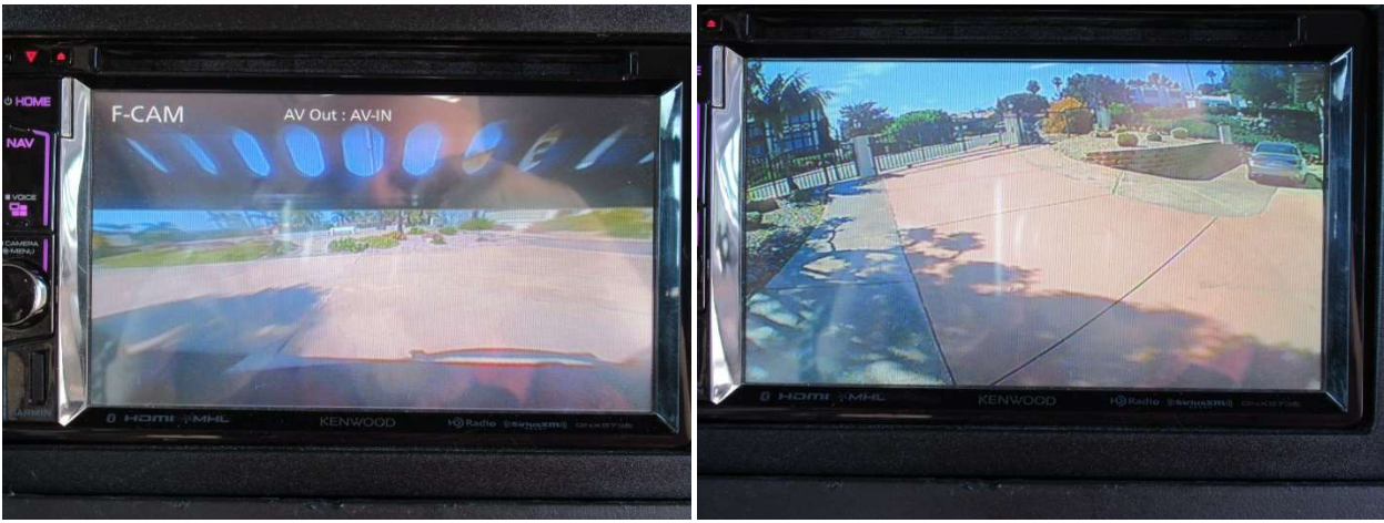
Front view camera and rear-view camera.