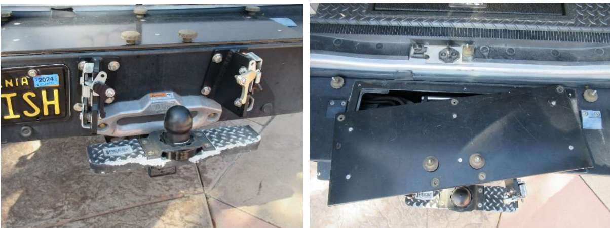
Rear hitch trailer ball & step, robust box & wheel latches, rear winch fairlead, winch & storage box with 5 screw knobs.