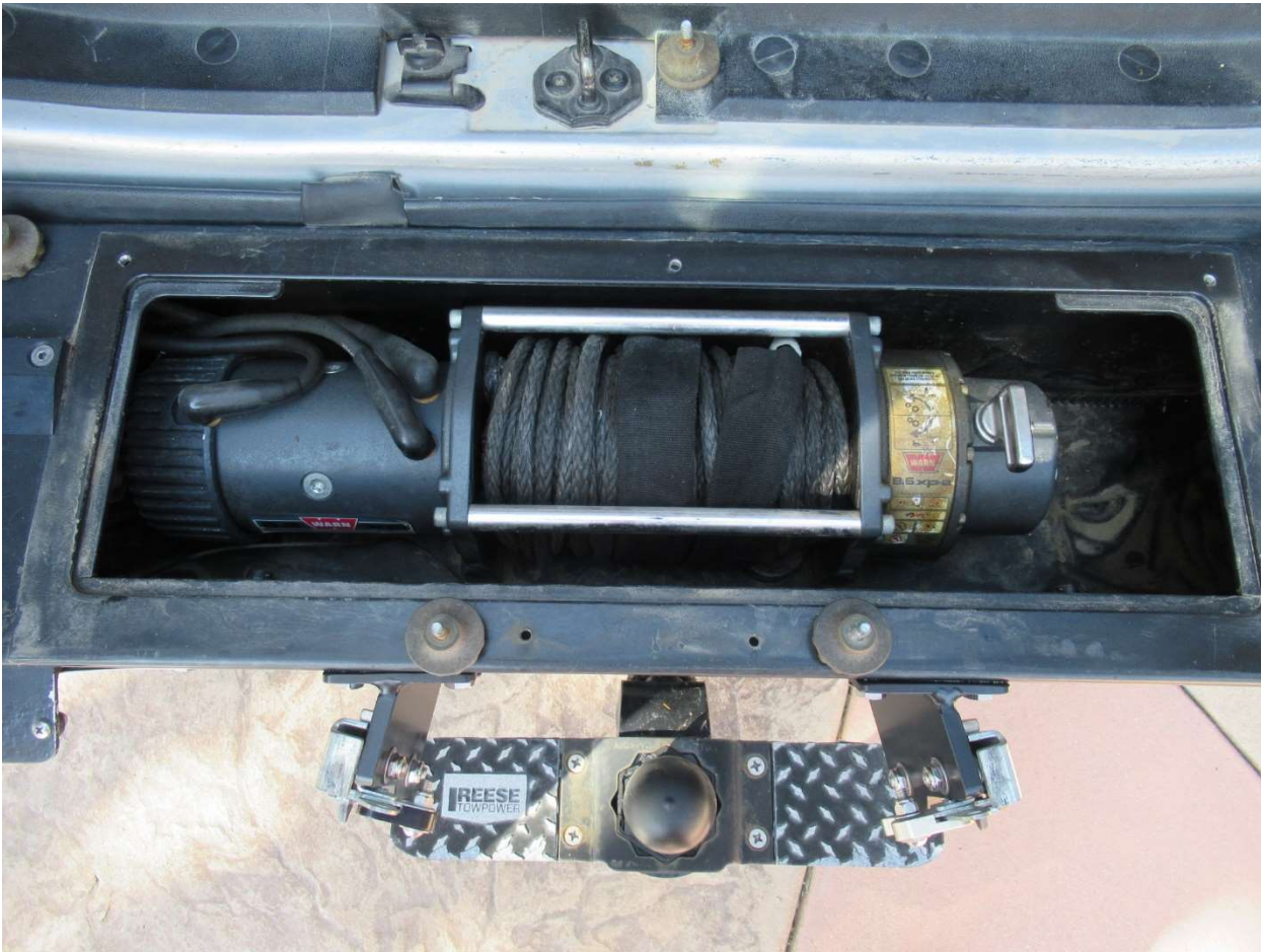
Rear 9,500-pound Warn winch with Dyneema cable.