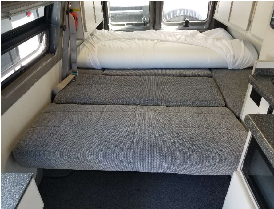
Olympic Queen bed, 67"W x 79"L, with custom memory foam topper.