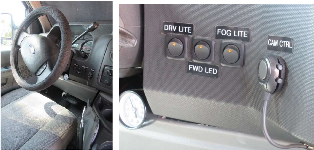
Controls and air tank gauge.