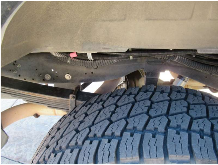
Right rear wheel suspension.