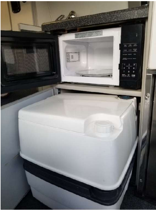
Sharp Microwave SMC0710BW, 10" carousel, 700W, 0.7 CF; Thetford portable toilet with 5-gallon tank