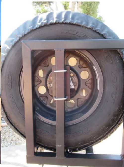
Spare tire mounted on driver rear bumper swingarm, lock pin secured.