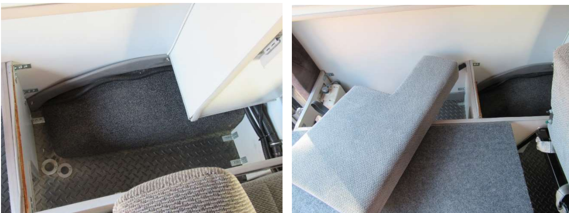
Wheel well storage area below cushion, accessible from interior.