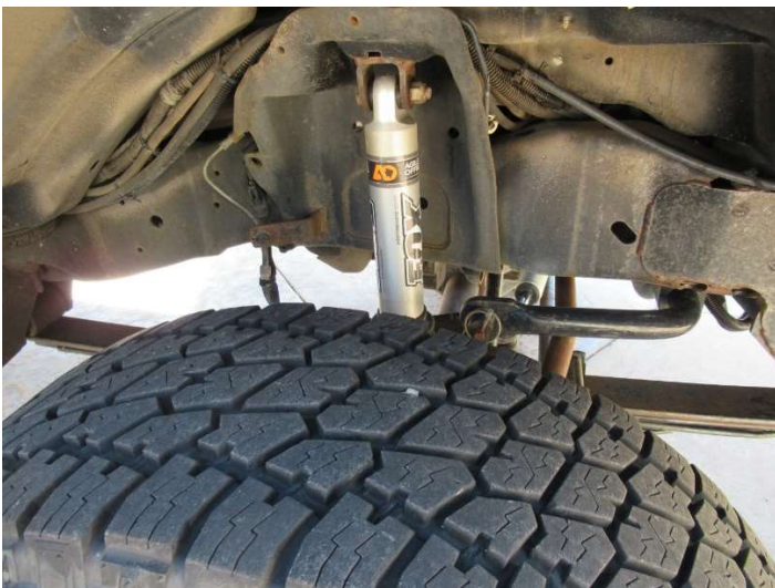
35" Nitto Terra Grappler G2 295/70R18 off-road tires all around, plus spare. (Right front wheel suspension shown).