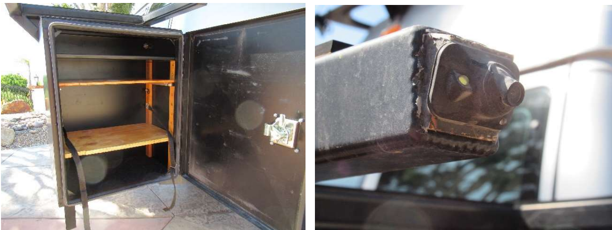
Rear passenger swing arm lockable bumper box, lock pin secured, interior 23.75"Wx29.5"Hx16"D with rear view camera.