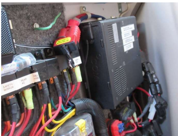
Views of fuse panel, including radio speaker and main radio body.