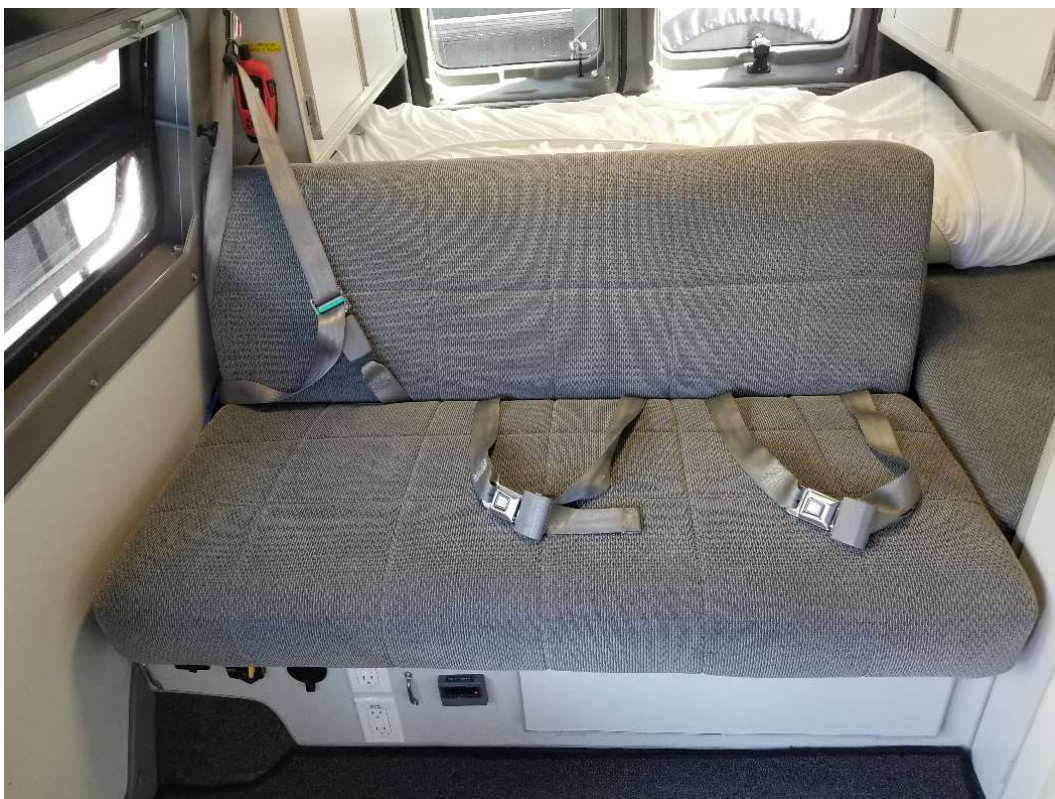
Passenger seat with 3 seat belts.

New custom carpet over Loncoin heavy-duty vinyl, swivel front passenger seat with deep storage pocket and fire extinguisher.