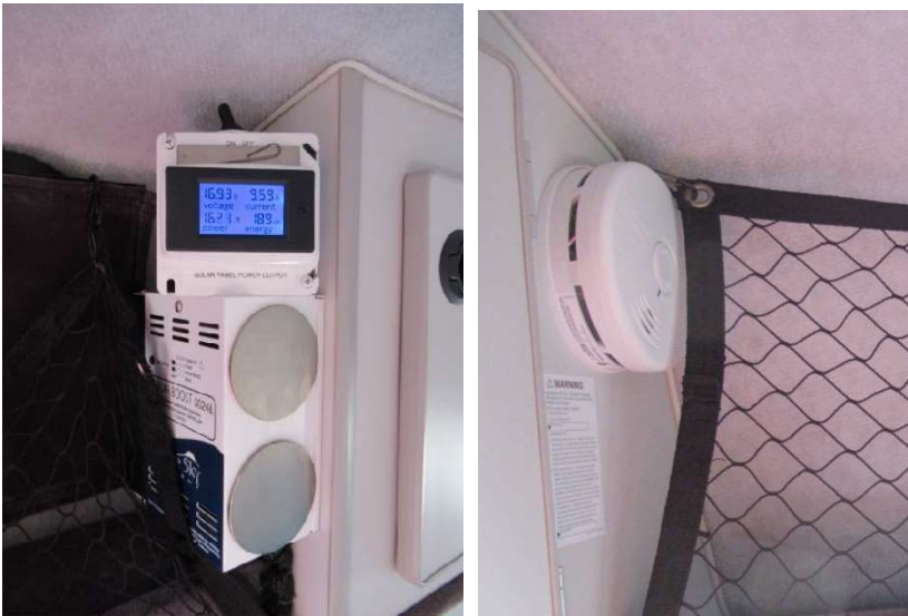
Supplemental solar panel controller and monitor, plus smoke alarm.