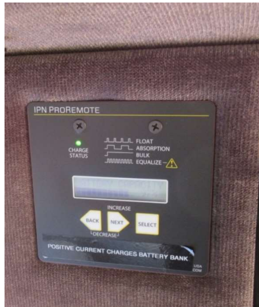
Inverter control panel and solar controller.