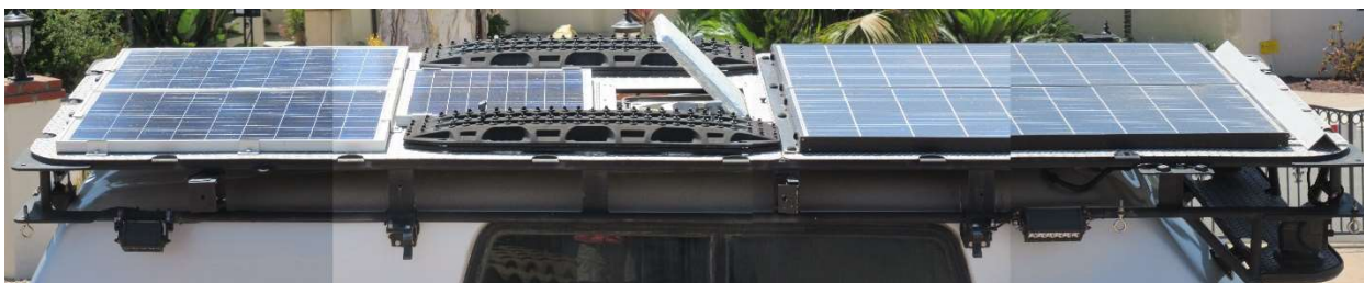
Aluminess roof rack with 520 watts solar panels, four Maxtrax recovery boards, and ceiling fan