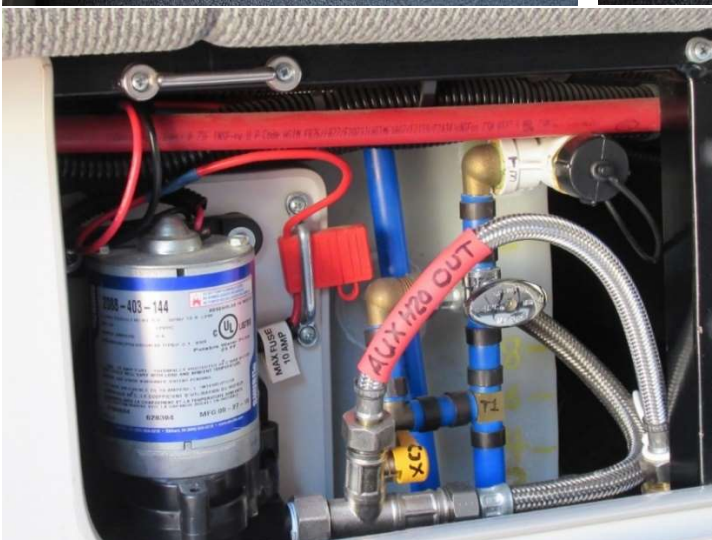
Underseat storage, water pump with switched intake/output connections for miscellaneous use. 12-volt plug, relay breaker, AC outlets, current meter for inverter, attachment points for cargo.