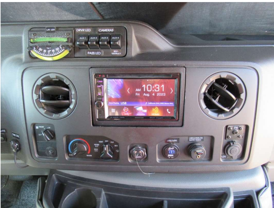
Kenwood head unit with navigation, altitude, distance, Sirius XM, off-air radio, USB port, Bluetooth for calls & phone music. Displays front and rear cameras on demand, with 5-speaker audio.