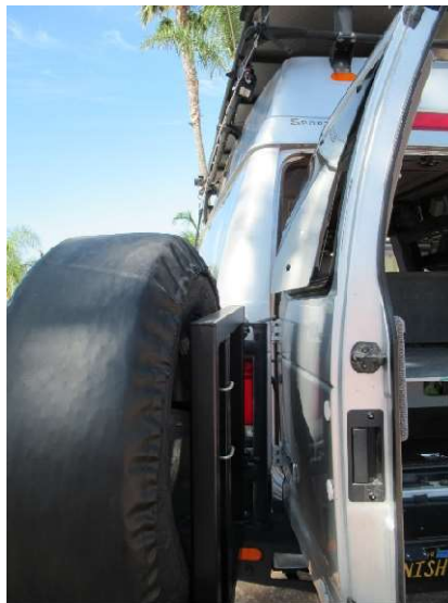
Side rear passenger and driver rear windows open.