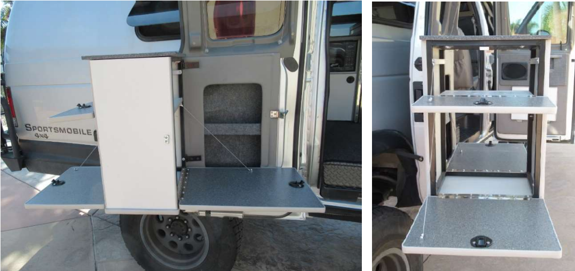
Galley box with two fold-down tables; storage compartment in door.