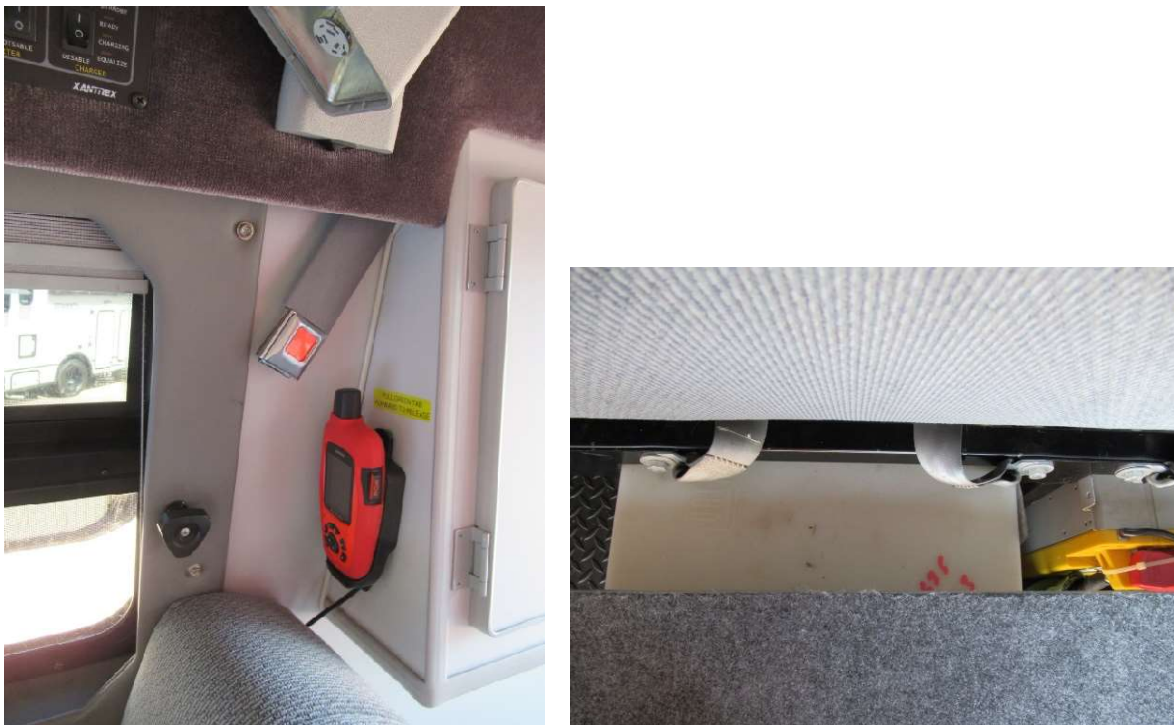
Garmin Inreach Explorer+ Satellite communicator (subscription required), 2000-watt inverter and 16-gallon water tank behind rear passenger seat.