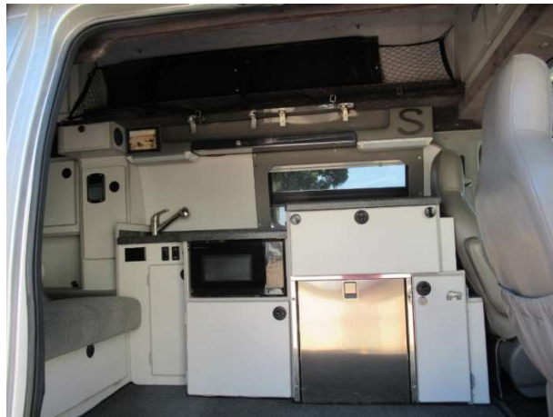
Door-mounted galley box, kitchen area with two-tier storage shelves, LED lights, heat reflective panel.