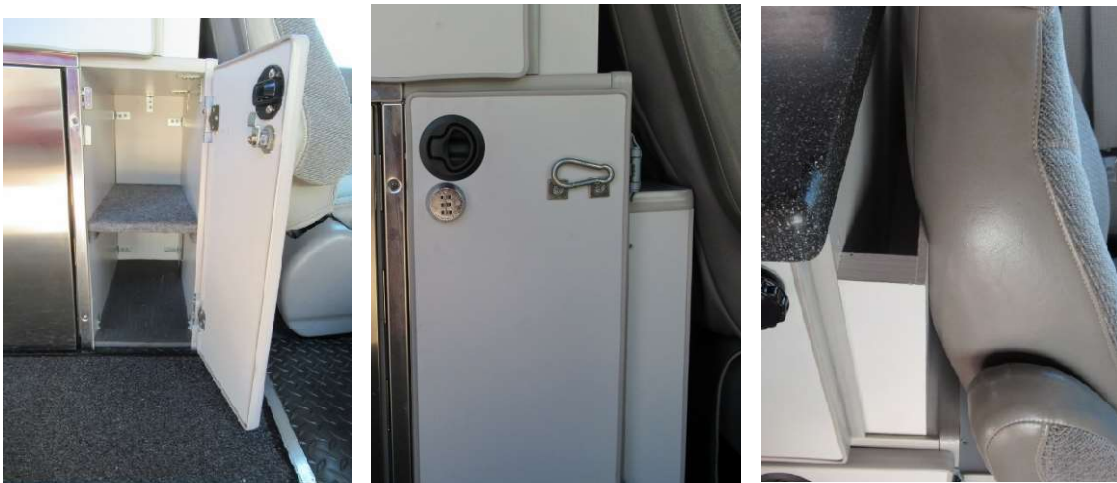
Locking storage cabinet, and slim compartment for maps/laptop behind driver seat.