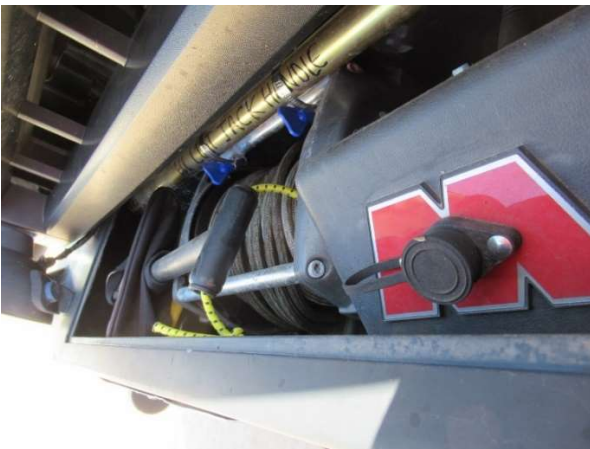
Front hatch with 12,000-pound Warn Winch with Dyneema cable, shovel, and Hi-Lift jack handle.