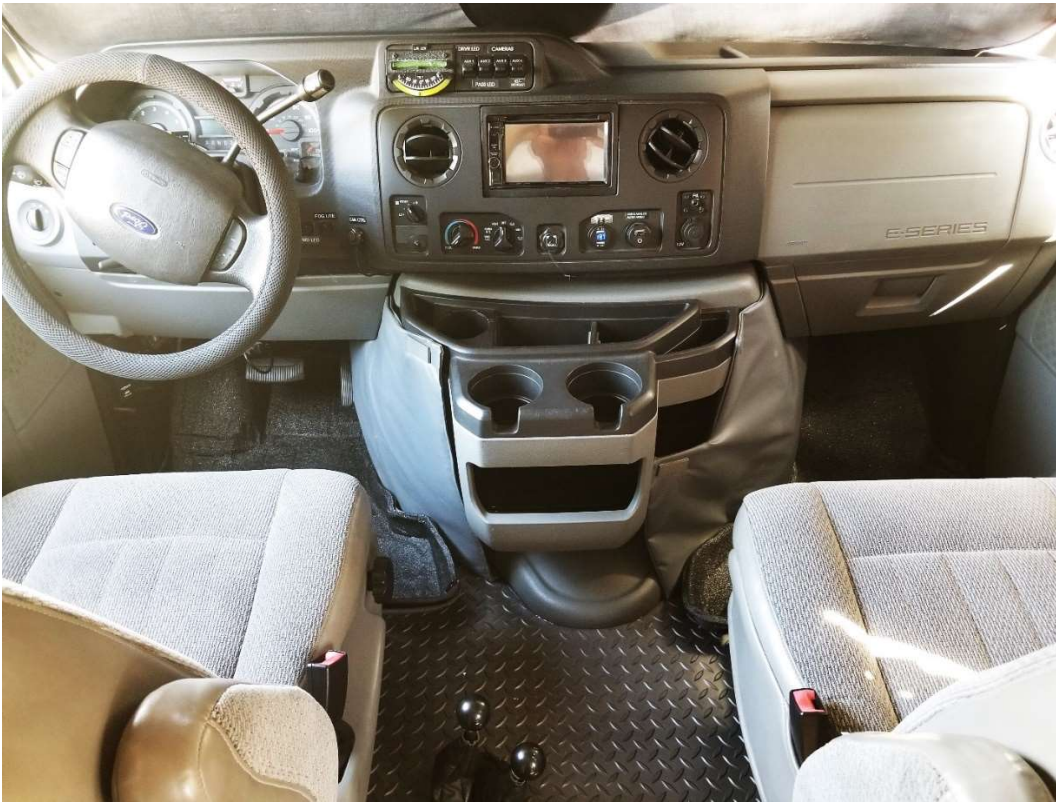
Line-X covered floor mats, driver and passenger sides, custom-made heat shields for doghouse.