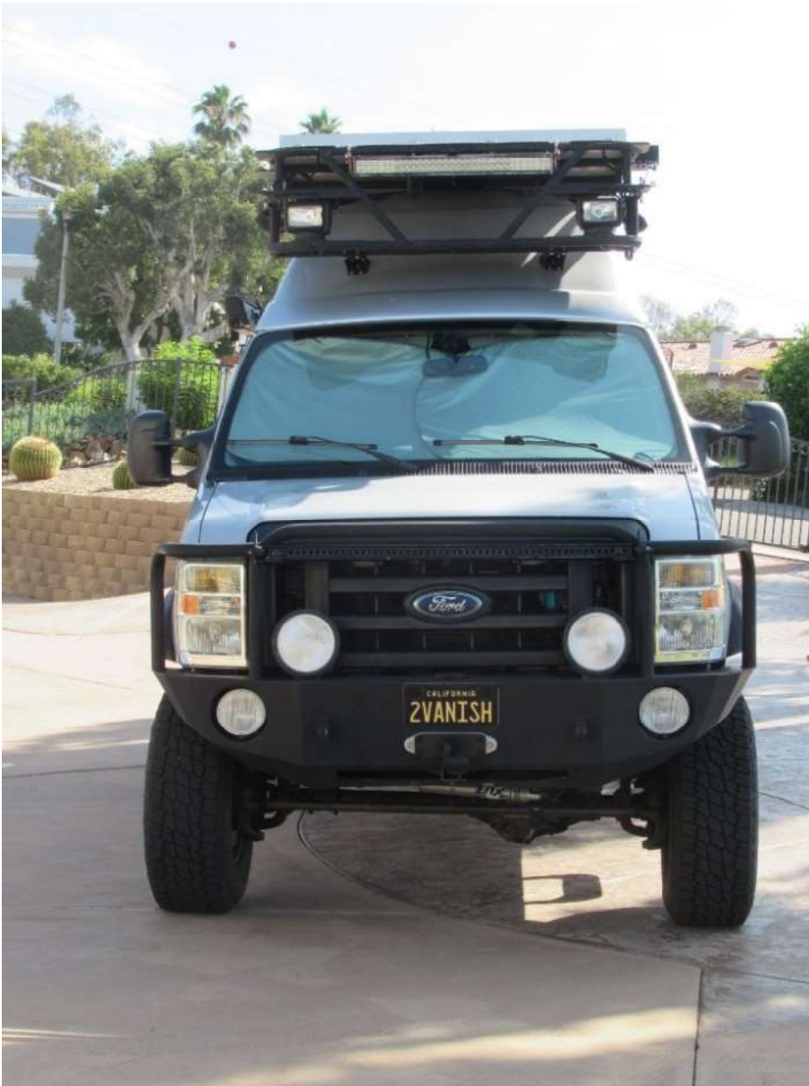
Exterior Front with HID-upgraded Ford headlights, front bumper winch, and other supplemental lights.