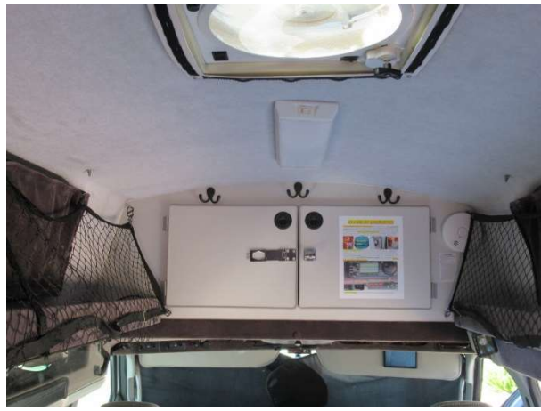
Lockable storage over front seats, 57x25x18, wedge shape. Insulated ceiling, with overhead air vent fan with cover, rain detecting.