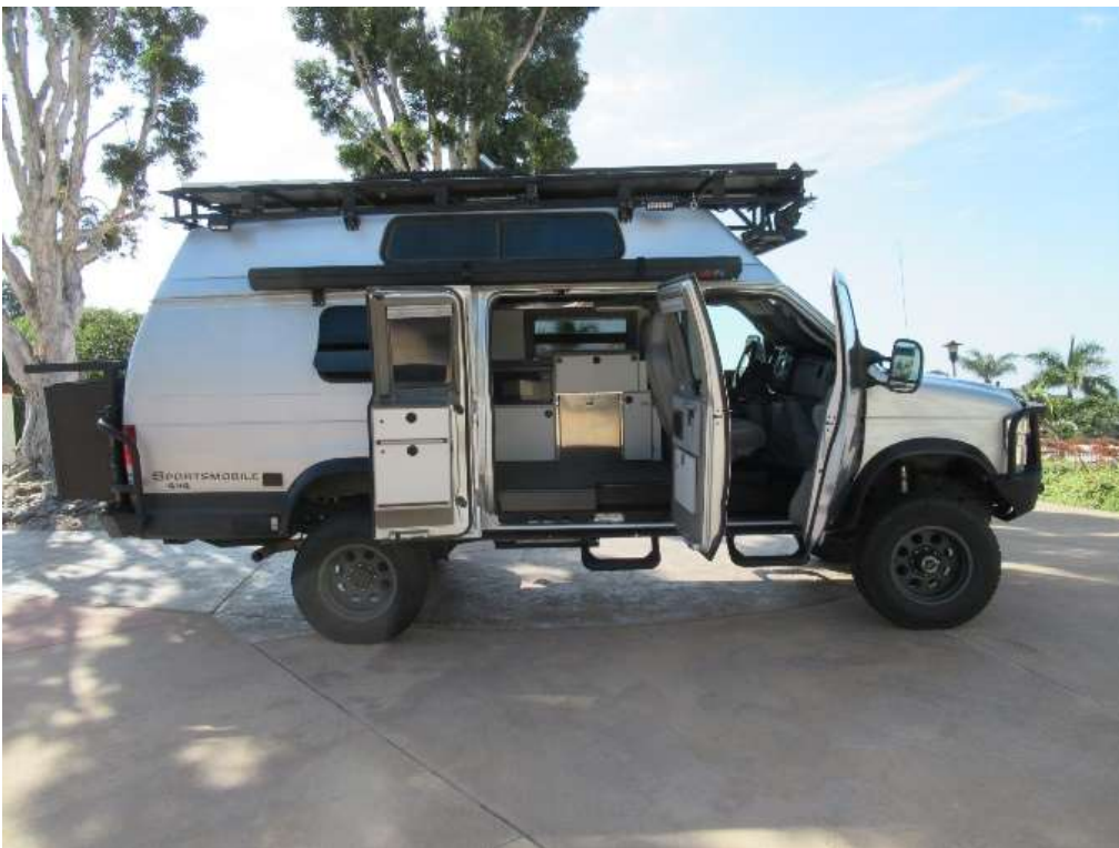
Exterior Passenger Side, doors open, showing heavy duty steps to access 37"H interior.