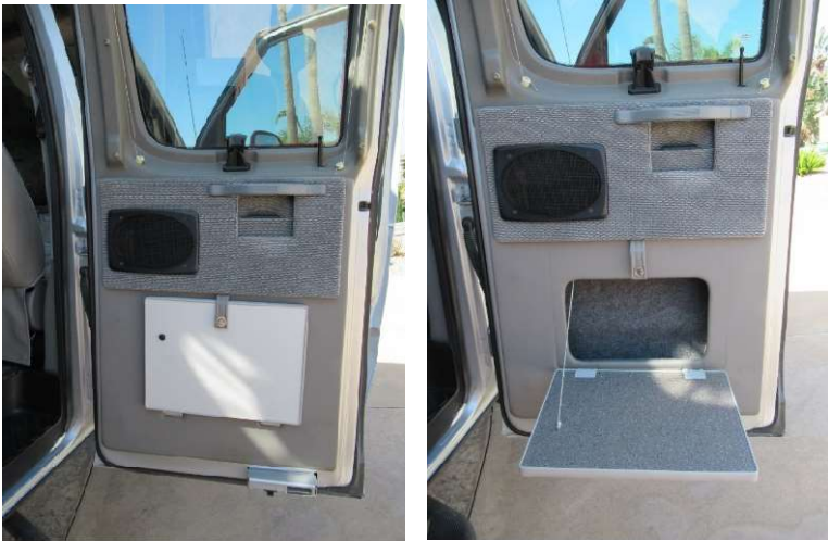
Passenger swing-out door with storage compartment and fold-down table.