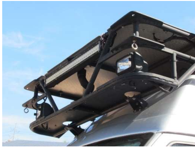
Aluminess front bumper with offroad lights, and roof rack with ultra-bright long distance light bar and directable spotlights.