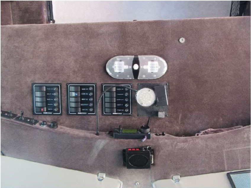
Custom cockpit controls for lights, lockers, and air compressor. Radio, PA, map light, and storage nook above passenger visor are shown.