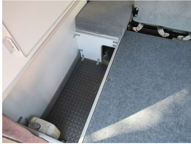
Interior rear storage: main compartment 40"Wx55"Dx13"H, and side cabinets 14"Wx36"Dx12"H.