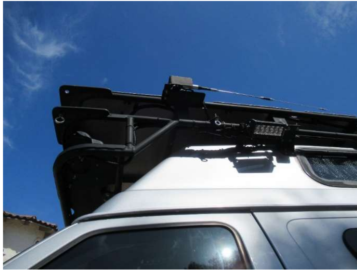
HAM radio antenna in raised and lowered positions (controlled by internal driver overhead switch).