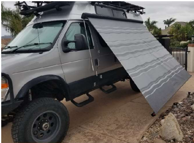
Fiamma F45Ti Titanium awning, 9'3" wide x 8' long, with two adjustable support legs that can be attached to van or rest on the ground, in excellent condition.