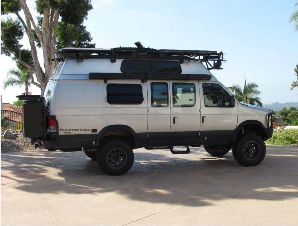
Exterior Passenger Side, Line-x rocker panels, and Bushwacker flares.