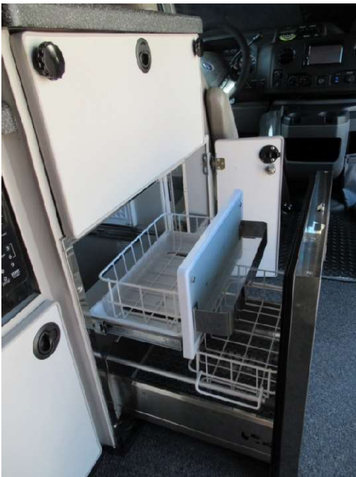
Isotherm "Drawer 65" 2.3 cubic foot 12-volt refrigerator with freezer compartment