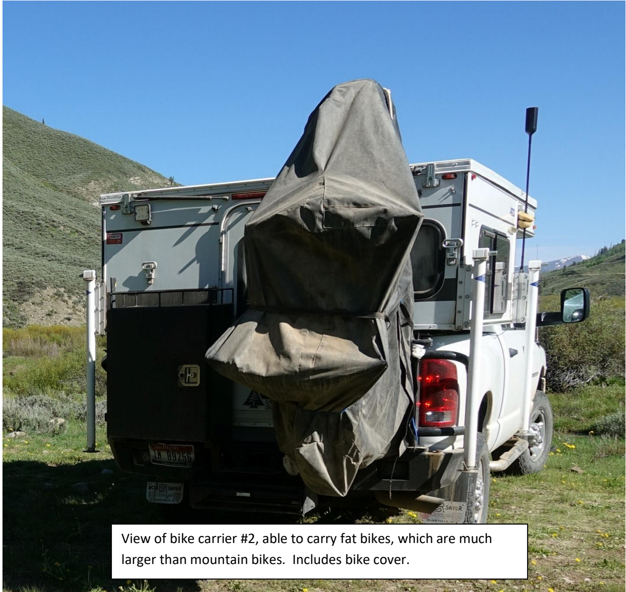
View of bike carrier #2, able to carry fat bikes, which are much larger than mountain bikes. Includes bike cover.