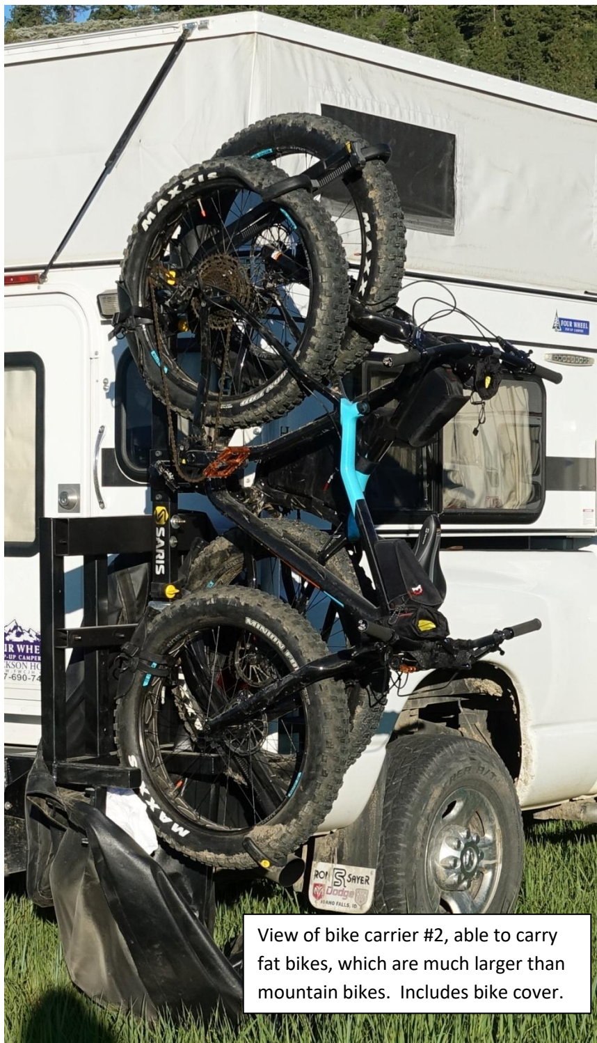
View of bike carrier #2, able to carry fat bikes, which are much larger than mountain bikes. Includes bike cover.