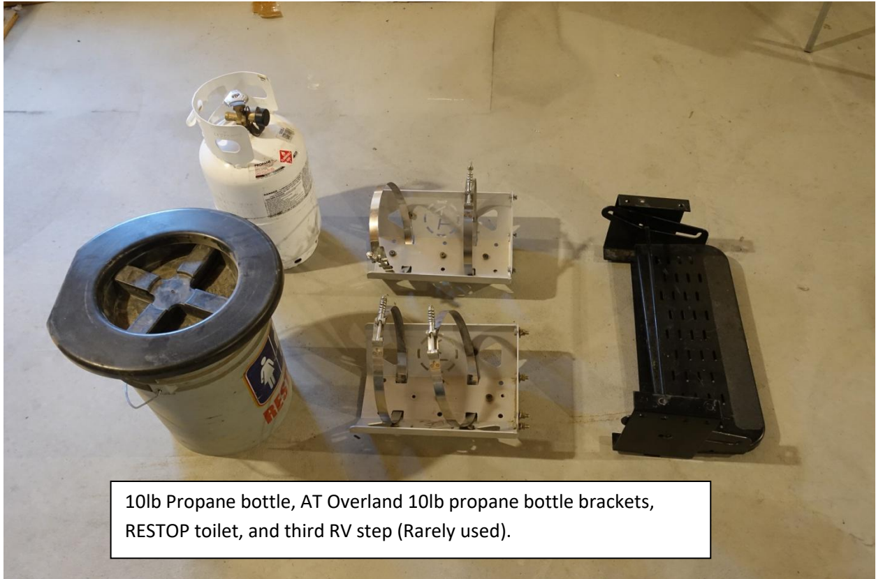
10lb Propane bottle, AT Overland 10lb propane bottle brackets, RESTOP toilet, and third RV step (Rarely used).