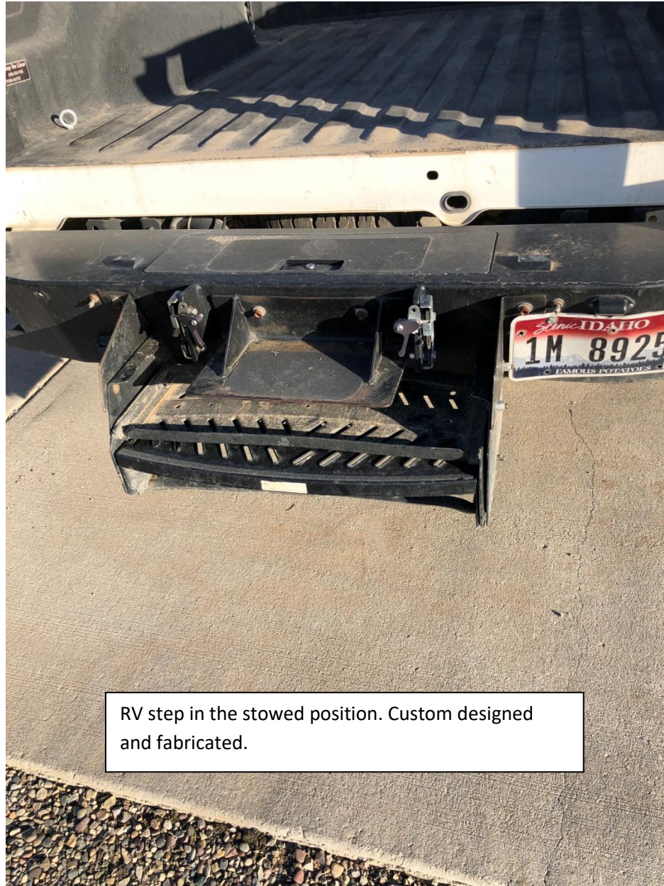
RV step in the stowed position. Custom designed and fabricated.