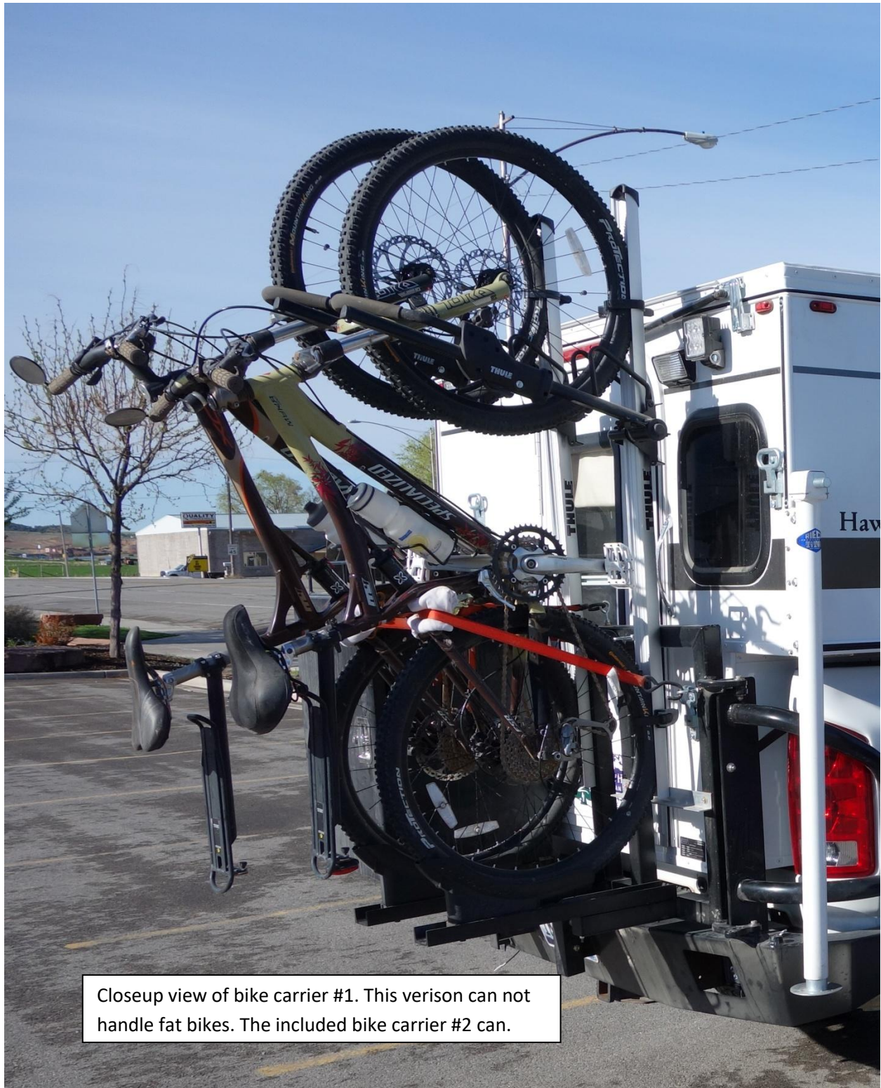
Closeup view of bike carrier #1. This version can not handle fat bikes. The included bike carrier #2 can.