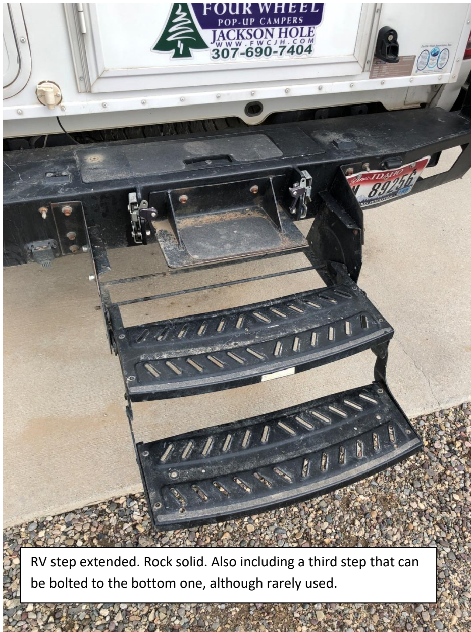
RV step extended. Rock solid. Also including a third step that can be bolted to the bottom one, although rarely used.