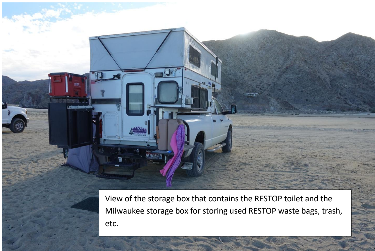
View of the storage box that contains the RESTOP toilet and the Milwaukee storage box for storing used RESTOP waste bags, trash, etc.